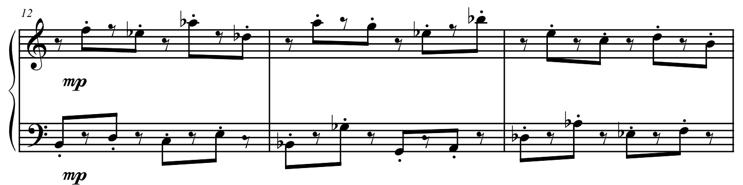
Note: In all of these Preludes, the speed, phrasing, and so on, is left to the creative interpretation of the performer. However, the intonation markings should probably be observed!