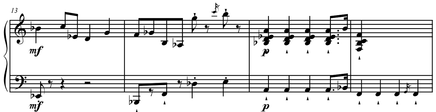
mf Note: In all of these Preludes, the speed, phrasing, and so on, is left to the creative interpretation of the performer. However, the intonation markings should probably be observed!